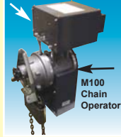
M100 Chain Operator