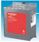
FireGard DC shown, BB and BV units similar.

Electro-mechanical devices enable automatic closing fire doors to respond to alarm signals from detection devices such as smoke detectors, heat sensors and central alarm signals, permitting doors to close long before high temperatures melt fusible links. Fusible links should always be used as backup to the release device.